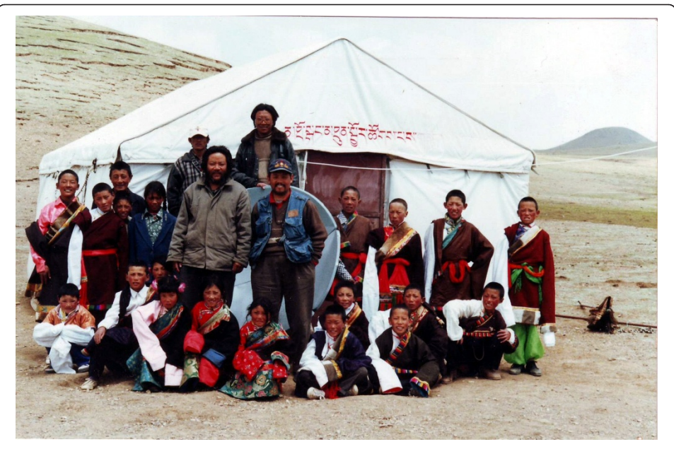
Figure 3 Muqu village school in its original location . Founded with assistance from the Upper Yangtze Organization and Plateau Perspectives in 2000.

with community members, decisions were made by others, and inappropriate supplies were purchased in distant locations) and as leadership of the school transitioned from being the responsibility of trusted local community leaders to impersonal government agencies and external organizations (Cardenas et al. 2000; Vollan 2008).