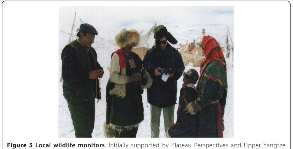
Organization, later also by Sanjiangyuan National Nature Reserve.

The authors and Plateau Perspectives equally have worked with the Sanjiangyuan National Nature Reserve since 2005, introducing more people-oriented approaches with a special focus on 'community co-management' of natural resources (Foggin 2005a; 2005b; 2010; Foggin and Bass 2010) (Figures 6 and 7; Table 1). In practice, a team of local herders has been strengthened, with key responsibilities ranging from raising local environmental awareness at community gatherings (e.g. during school holidays and annual festivals); to anti-poaching patrols; to the regular monitoring of