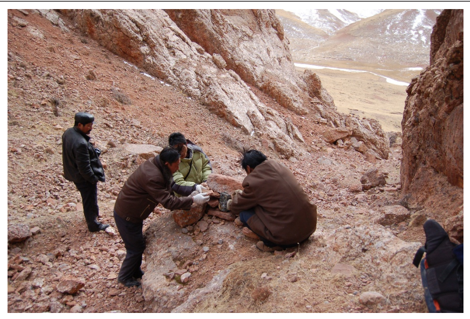
Figure 8 Setting up an automatic camera-trap for wildlife monitoring, as part of the Suojia community co-management project. The first target species for co-management work was the snow leopard. Plateau Perspectives and partners began use of camera-traps in 2009.

cameras, outdoor clothing, and ID badges (to indicate the wardens' authority to carry out their duties) have also been provided. All these inputs and activities over the past few years appear to have laid a good foundation for genuine cooperation between local communities, government, and external agencies (which can provide expertise, facilitation, and/or funding), through some form or other of collaborative management.