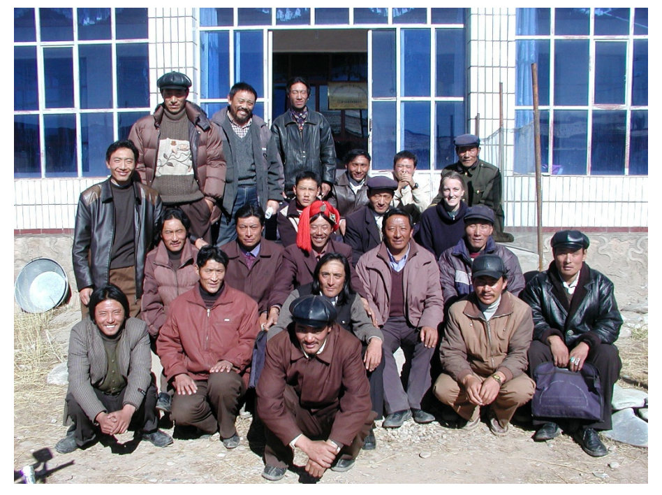
Figure 4 First village doctor training course provided by Plateau Perspectives (2004) . Continuing medical education provided as part of collaboration with local health bureau authorities.

In response to a request from the health bureau, young women from many villages in the project area also came for training in women's health work (around 25 women in Zhiduo County, and 15 women in Zaduo County). Training modules were given by two doctors and a midwife. The students enjoyed the course, participated well (e.g. writing health songs and engaging in role play), and made considerable progress in terms of knowledge and skills gained during the 3-week workshops. Some of these women were also later invited to village meetings (usually attended only by men). Further training of women's health workers has been requested, as there is still a great need to train some of them to a higher level. Yet even now, the women trained are already recognized as a new kind of health worker, better attuned to the specific needs of mothers and children, and of women in general. Many of the trainees also received teaching from the Centre for Disease Control on how to give immunizations, as suggested by one local community