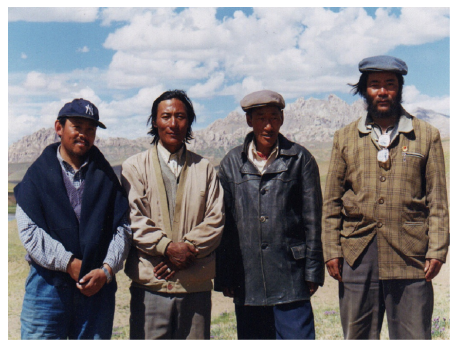
Figure 2 Founding members of the Upper Yangtze Organization. Established in Zhiduo County in 1998.

conservation and development ventures - some embryonic, some more developed, but all committed to greater involvement in these important matters. On the basis of initial successes, we have equally noted that some provincial government authorities are beginning to adopt a new view with respect to conservation, namely to value the role that 'community co-management' could play regionally in the management and conservation of natural resources. Additional information about these and of other conservation or sustainability-oriented initiatives in the region can also be found in (Breivik (2007); Cyranoski (2005); Foggin (2010); Foggin and Bass (2010); Hao (2008); McBeath and McBeath (2006); Morton 2007a; b; Phillips (2009)) and (Shao et al. (2006)).