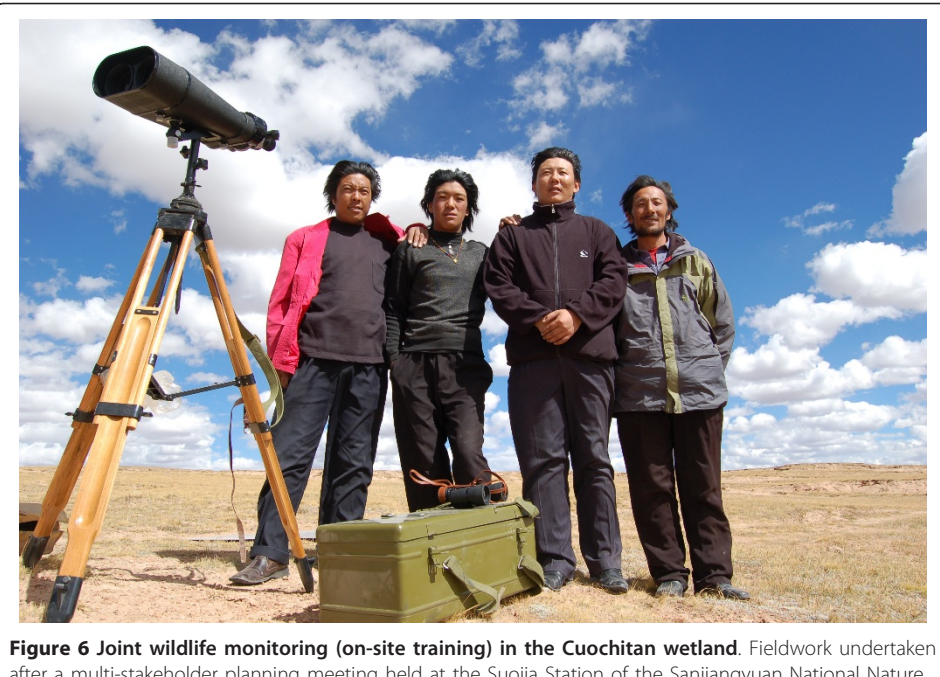
Figure 6 Joint wildlife monitoring (on-site training) in the Cuochitan wetland. Fieldwork undertaken after a multi-stakeholder planning meeting held at the Suojia Station of the Sanjiangyuan National Nature Reserve in October 2007, marking the formal start of a community co-management project in the Suojia area.

wildlife including Tibetan wild ass, wild yak, black-necked crane, and snow leopard (Figure 8). Several planning meetings and training workshops have been organized, cohosted by the nature reserve, to assist with species identification and monitoring protocols as well as data collection, analysis, storage, and retrieval. In addition, binoculars,